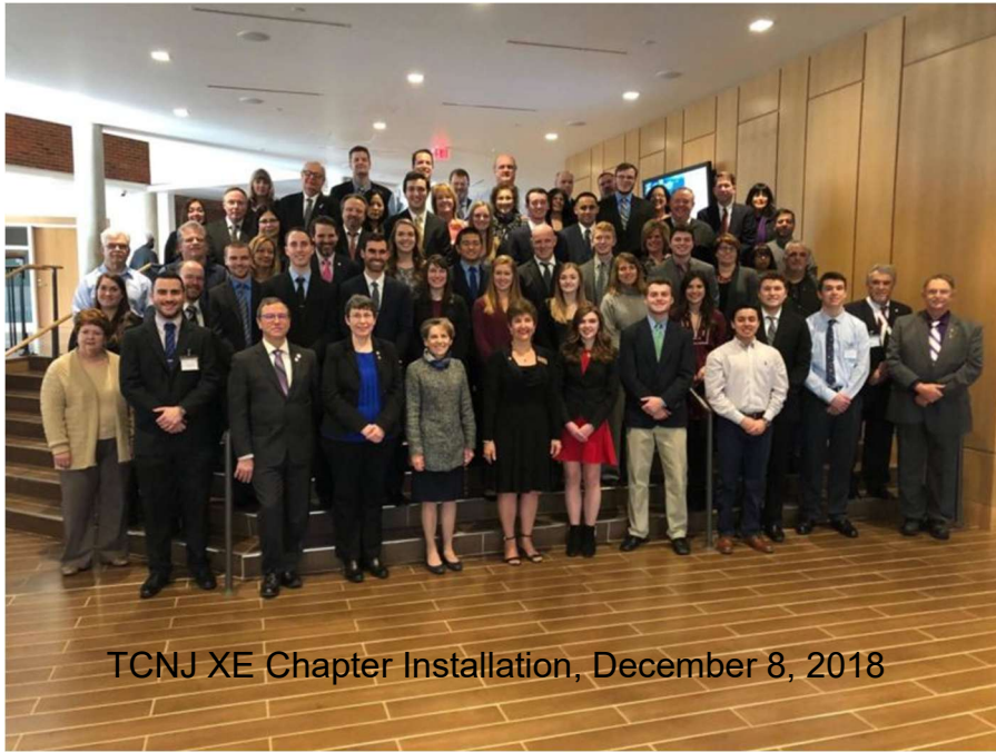
TCNJ XE Chapter Installation, December 8, 2018