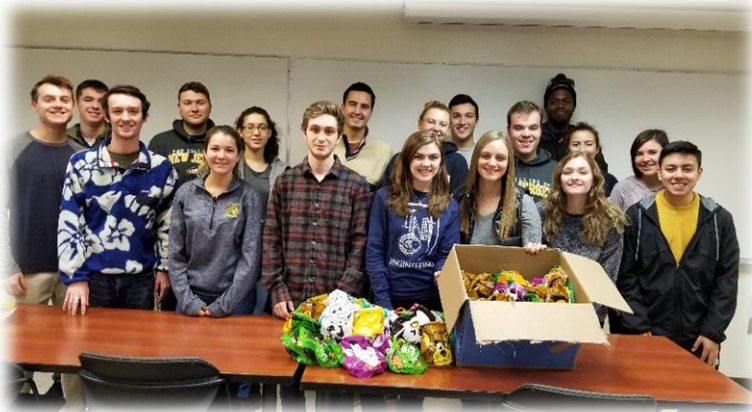
On the Wednesday before Halloween, members of TCNJ's CEHS and ASCE made gift bags for Anchor House and Homefront. The bags went to underprivileged kids and families in our local area. We had a great time making these gift bags for the families and hope to participate in a similar activity soon.