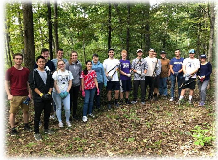
Fall Service at the Watershed Institute in Pennington, CEHS helped clear out invasive species in the watershed property.