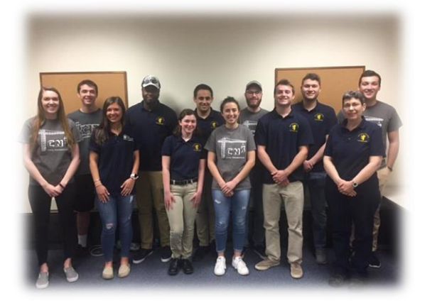
Students and faculty celebrated "Proud to be a Civil Engineer Day" on April 10<sup>th</sup> by wearing polos sold by XE and other engineering attire.

XE sophomores, juniors, and seniors participated in our Annual Spring Service at the Colonial Lake Cleanup event. These members picked up over 70 lbs of trash and recyclables!